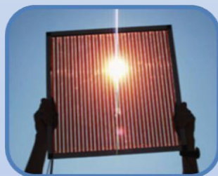
Some devices that use conductive glass: OLEDs (left) and DSCs (right).

The conductive glass distributed by Xop Glass is provided by Pilkington Glass Company and Nippon Sheet Glass Company (NSG, low iron content). There are several sheet resistances available to choose, from 15 to 8 \Omega/\square .