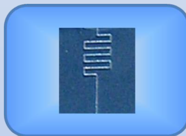
Lines drawn on FTO by laser scribing.

Xop Glass has also the technology to create linear gaps on the glass to provide insulating areas. These lines can be done as straight lines, serrated, circular or in the way wished by the customer by means of laser scribing, providing thicknesses in the microns range (thicknesses from 150 to 1000 \mu\text{m} can be achieved).